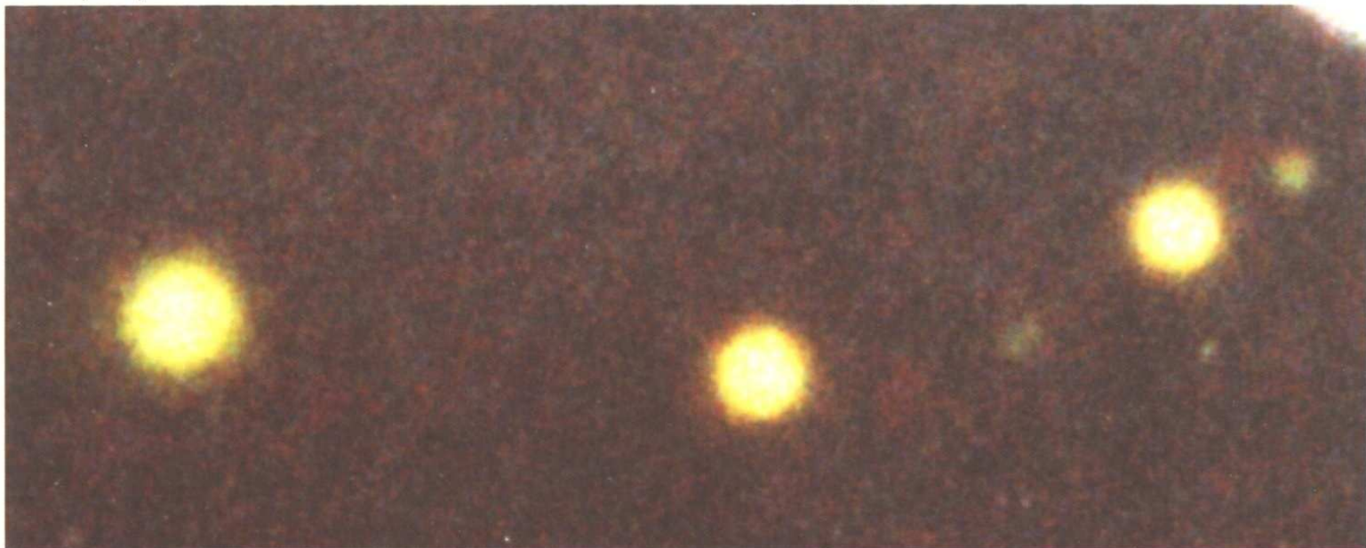
Figure 5. From left to right, UFOs #2, 3, and 4. Note that there are three other anomalous objects or lights surrounding UFO#4.